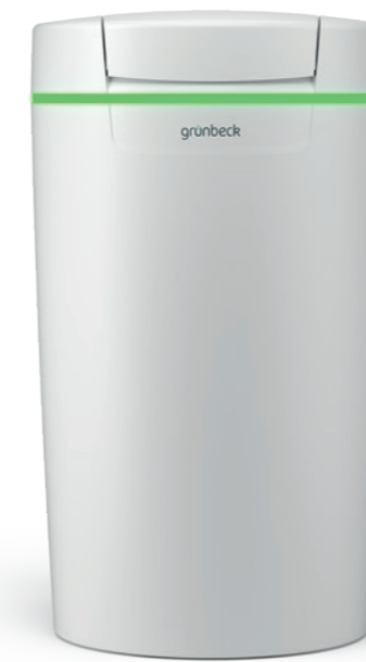
Water softener softliQ:MD

The proven series of softliQ:SD systems was expanded by one system size. The softliQ:SD18 reliably provides up to 4 people with soft water. The softliQ:SD21 is suitable for up to 9 people and covers your and your family's needs even better than before. However, with the new softliQ systems you will not only experience new worlds of soft water. The softliQ:SD23 also offers you the full range of performance. Our performer in the field of small-scale water softeners comes fully equipped. An insulation kit and the drain connection are already included in its scope of supply. Via the new communication interfaces, it directly interacts with you and other Grünbeck systems. And it ensures the supply of up to 12 people with soft water.