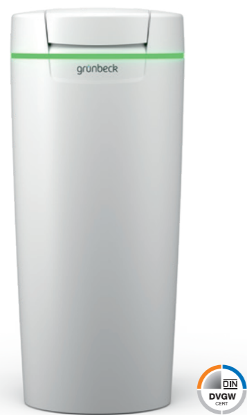
Water softener softliQ:SD

Exploit the full range of performance – with the new softliQ systems. All system types feature the new touch display which provides user-friendly and intuitive operation. Your system thinks ahead: By means of the infrared light sensor, the softliQ system measures the filling level of the salt and reminds you in time to refill. You are always well informed – via the display, Grünbeck's myProduct app or, if so desired, by email. The integrated water sensor, which monitors the system's installation site for uncontrolled water leaks, provides additional safety for your home.